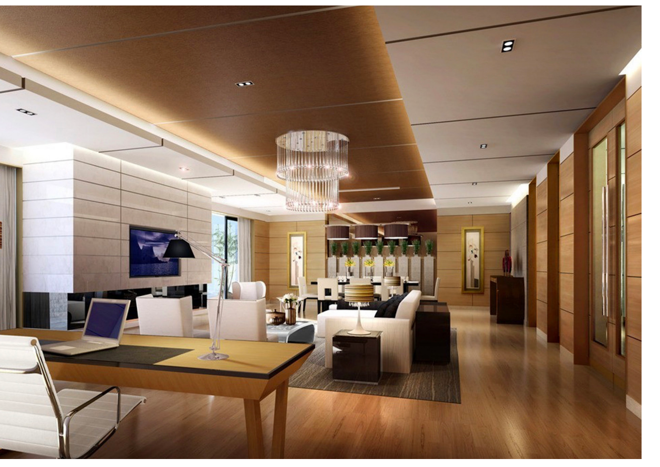
\triangleleft \Delta Zen residence