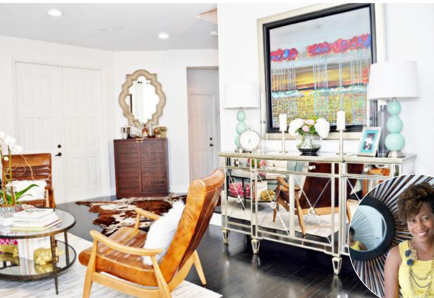
Nicole White WWW.NWDINTERIORS.COM Sunrise, Florida 33323