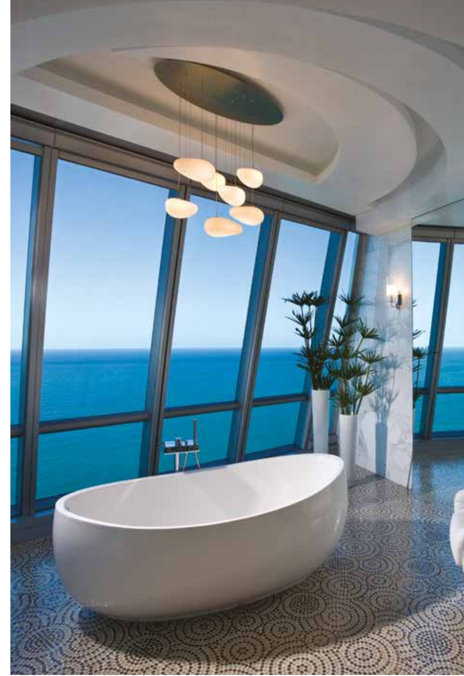
The full-height slanted glass walls offer panoramic ocean views while taking a languorous bath in the stand-alone Hydrology bathtub.

108 | Metropolitan Home Metropolitan Home | 109